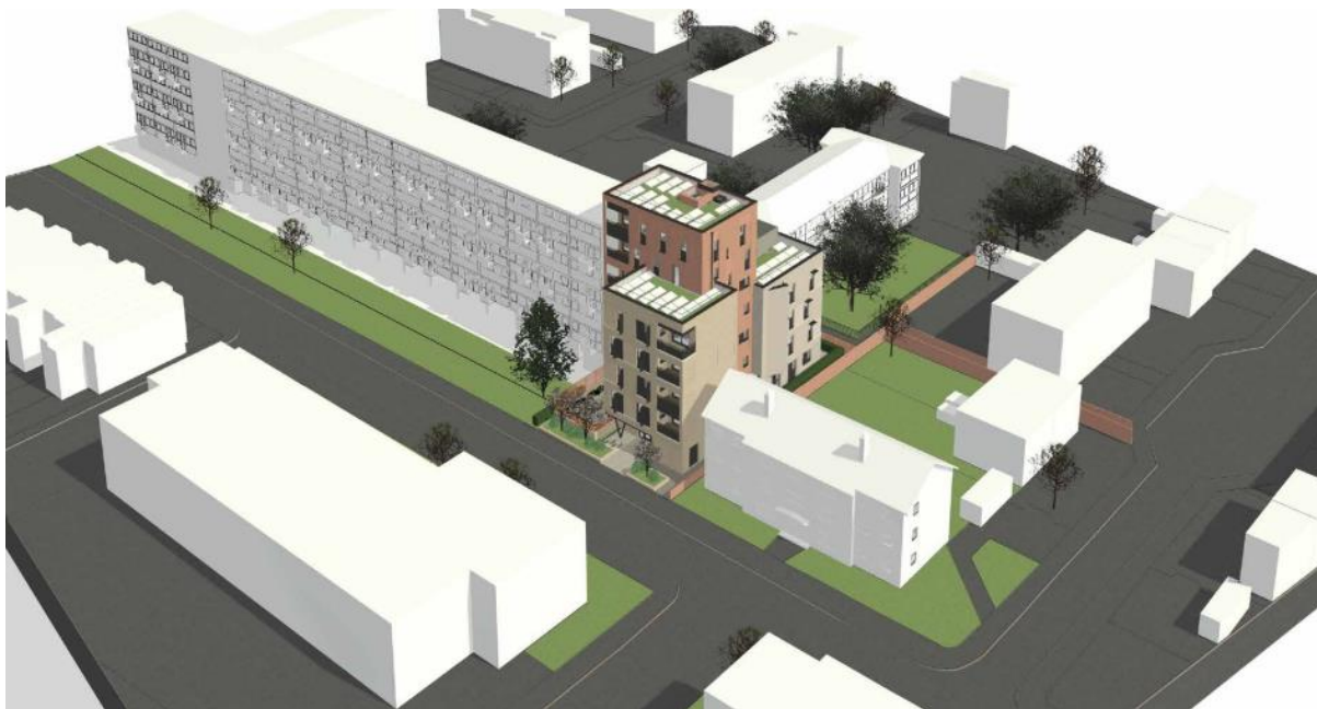
Ariel view looking North-East