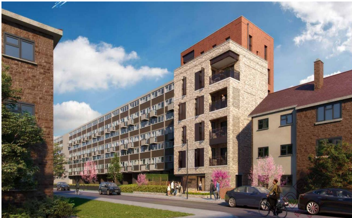
Street view looking North-East on Boyton Road